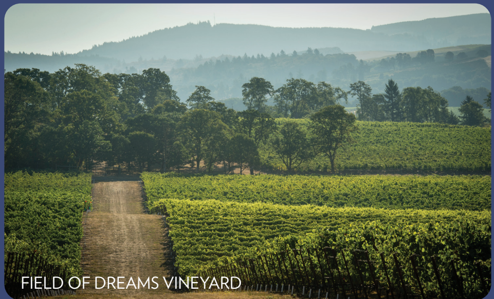
FIELD OF DREAMS VINEYARD