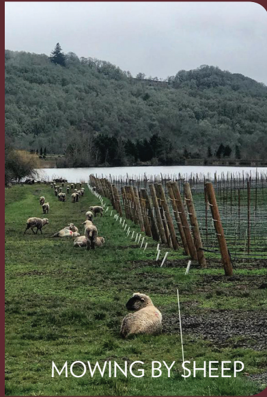
MOWING BY SHEEP