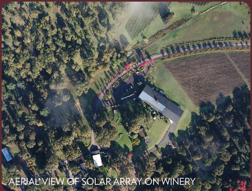
AERIAL VIEW OF SOLAR ARRAY ON WINERY