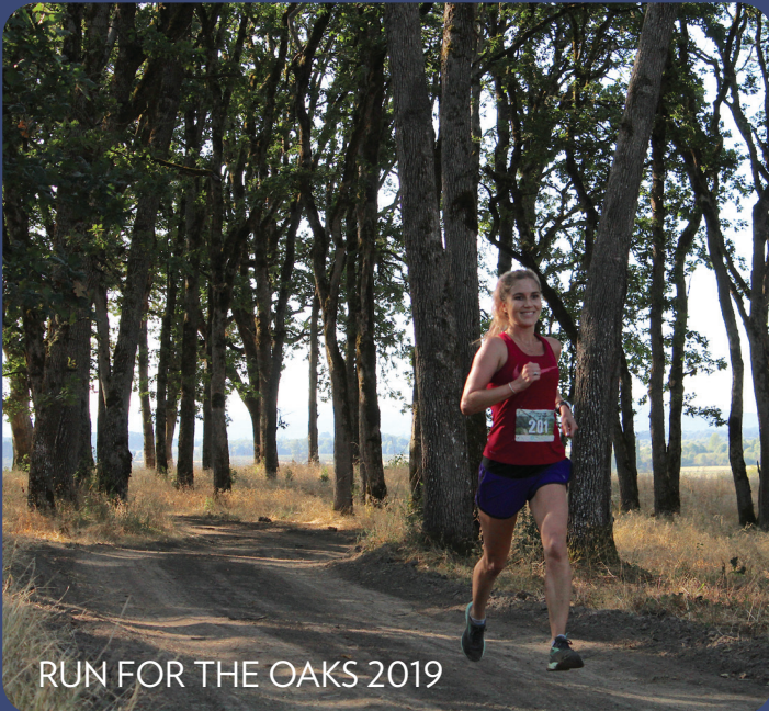
RUN FOR THE OAKS 2019

Through partnerships with NRCS, US Fish & Wildlife, and Polk County, Left Coast has restored over 100 acres of Oregon White Oak savannah and forest.