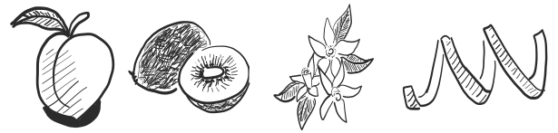
Peach Kiwi Orange Blossom Lemon Peel